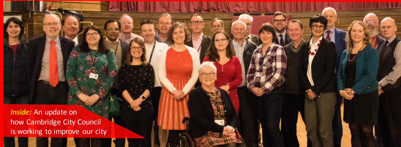
Inside: An update on how Cambridge City Council is working to improve our city